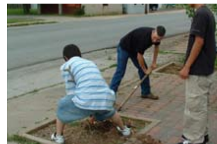
Performing Community Service

The PayBack program is designed to provide an opportunity for young people, aged 9-16, to pay their court ordered restitution to victims, while acquiring basic work skills, gaining an increased sense of self-esteem,